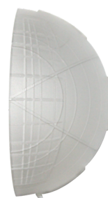
Blinds PD4 Art.No: 92313

Battery: 3.0 V Lithium CR2032 (inclusive) Dimensions: 57 x 35 x 7 mm Material color: -