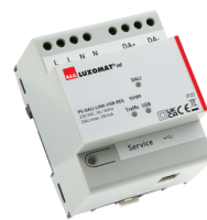
PS-DALI-LINK-USB-REG Art.No: 93189

Voltage: 110 – 277 V AC 50 / 60 Hz Dimensions: 240 x 26 x 26 mm Output voltage: 16 V DC (DALI, typical)