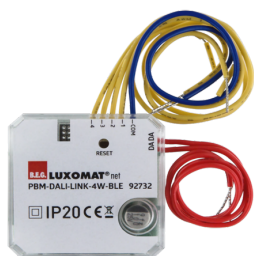
PBM-DALI-LINK-4W-BLE Art.No: 92732

Voltage: 230 V AC -15/+10% 50 / 60 Hz Dimensions: 90 x 72 x 64 mm (4 TE) Settings: with Firmware update function button, B.E.G. PC Tools