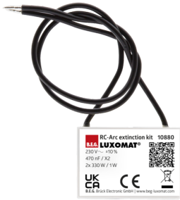
RC-Arc extinction kit Art.No: 10880

Voltage: 230 V AC \pm 10\% Dimensions: 38 x 12 x 26 mm Degree / class of protection: IP20 / Class II