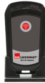
BLE-IR-Adapter Art.No: 93067

Voltage: 230 V AC \pm 10\% Dimensions: 50 x 23 x 8 mm Degree / class of protection: IP20 / Class II