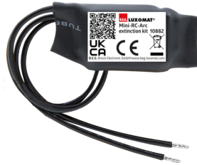
Mini-RC-Arc extinction kit Art.No: 10882

Voltage: 230 V AC \pm 10\% Dimensions: 38 x 12 x 26 mm Degree / class of protection: IP20 / Class II