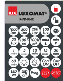
IR-PD-KNX Art.No: 92123

Dimensions: 47 x 19 x 10 mm Degree / class of protection: IP20 Ambient temperature: -20 °C to +40 °C