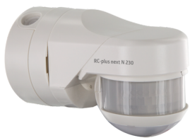
RC-plus next N 230 KNXs-DX 230 Art.No: 93527

To receive the bundle according to the technical specification, please order the items listed.