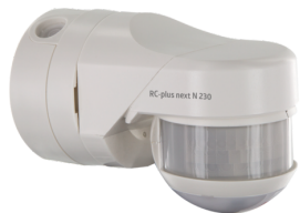
RC-plus next N 230 KNXs-DX 230 Art.No: 93527

To receive the bundle according to the technical specification, please order the items listed.