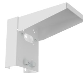
Wall holder with weather protection Art.No: 93222

Dimensions: 188 x 98 x 134 mm Housing: stainless steel Material color: stainless steel