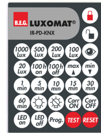
IR-PD-KNX Art.No: 92123

Dimensions: 47 x 19 x 10 mm Degree / class of protection: IP20 Ambient temperature: -20 °C to +40 °C