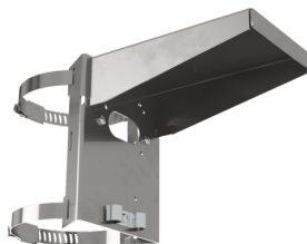
Pole holder with weather protection Art.No: 93220

Dimensions: Ø 71 x 34 mm Degree / class of protection: IP54 Housing: polycarbonate, UV-resistant