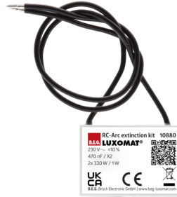
RC-Arc extinction kit Art.No: 10880

Battery: 3.0 V Lithium CR2032 (inclusive) Dimensions: 80 x 60 x 8 mm Material color: -