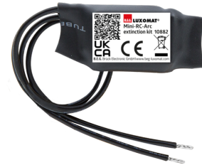
Mini-RC-Arc extinction kit Art.No: 10882

Battery: 3.0 V Lithium CR2032 (inclusive) Dimensions: 80 x 60 x 8 mm Material color: -