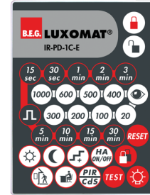
IR-PD-1C-E Art.No: 92077

Voltage: 230 V AC \pm 10\% Dimensions: 38 x 12 x 26 mm Degree / class of protection: IP20 / Class II