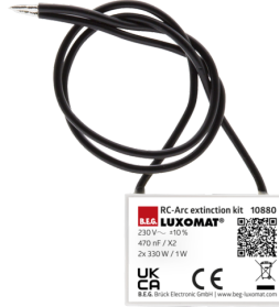
RC-Arc extinction kit Art.No: 10880

Battery: 3.0 V Lithium CR2032 (inclusive) Dimensions: 80 x 60 x 8 mm Material color: -