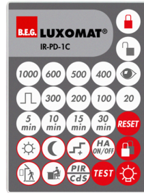
IR-PD-1C Art.No: 92520

Battery: 3.0 V Lithium CR2032 (inclusive) Dimensions: 57 x 35 x 7 mm Material color: -