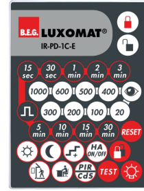
IR-PD-1C-E Art.No: 92077

Voltage: 230 V AC \pm 10\% Dimensions: 38 x 12 x 26 mm Degree / class of protection: IP20 / Class II