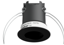
Mounting set PICO Art.No: 93776

Dimensions: Ø 45 x 50 mm Degree / class of protection: IP20 Housing: polycarbonate, UV-resistant