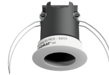
Mounting set PICO Art.No: 93777

Dimensions: Ø 45 x 50 mm Degree / class of protection: IP20 Housing: polycarbonate, UV-resistant