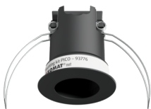
Mounting set PICO Art.No: 93776

Dimensions: Ø 45 x 50 mm Degree / class of protection: IP20 Housing: polycarbonate, UV-resistant