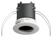
Mounting set PICO Art.No: 93775

Battery: 3.0 V Lithium CR2032 (inclusive) Dimensions: 57 x 35 x 7 mm Material color: -