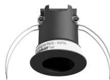
Mounting set PICO Art.No: 93776

Dimensions: Ø 45 x 50 mm Degree / class of protection: IP20 Housing: polycarbonate, UV-resistant