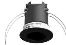
Mounting set PICO Art.No: 93778

Dimensions: Ø 45 x 50 mm Degree / class of protection: IP20 Housing: polycarbonate, UV-resistant