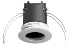
Mounting set PICO Art.No: 93775

Battery: 3.0 V Lithium CR2032 (inclusive) Dimensions: 57 x 35 x 7 mm Material color: -