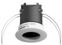
Mounting set PICO Art.No: 93777

Dimensions: Ø 45 x 50 mm Degree / class of protection: IP20 Housing: polycarbonate, UV-resistant