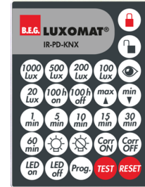
IR-PD-KNX Art.No: 92123

Dimensions: 47 x 19 x 10 mm Degree / class of protection: IP20 Ambient temperature: -20 °C to +40 °C