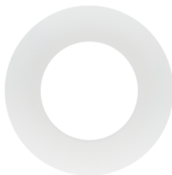
Cover ring PD9 Ø 36 mm Art.No: 92238

Dimensions: Ø 36 mm Housing: polycarbonate, UV-resistant Material color: anthracite glossy