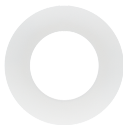
Cover ring PD9 Ø 36 mm

Dimensions: Ø 36 mm Housing: polycarbonate, UV-resistant Material color: anthracite glossy