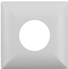
Square design frame PD9-FC Art.No: 92993

Dimensions: Ø 45 mm Material color: silver mat