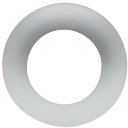
Cover ring PD9 Ø 36 mm Art.No: 92237

Dimensions: Ø 36 mm Housing: polycarbonate, UV-resistant Material color: white glossy