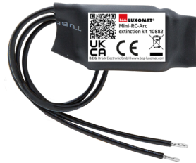
Mini-RC-Arc extinction kit Art.No: 10882

Battery: 3.0 V Lithium CR2032 (inclusive) Dimensions: 57 x 35 x 7 mm Material color: -