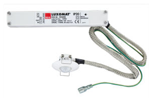
PD9-M-1C-FC Art.No: 92900

To receive the bundle according to the technical specification, please order the items listed.