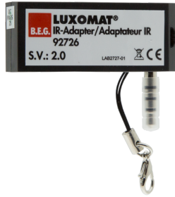
IR-Adapter for Smartphones Art.No: 92726

Dimensions: 40 x 55 x 103 mm Material color: black Frequency: 2.4 GHz ISM band, GFSK 0.2 dBm + 5.3 dBi = 5.5 dBm