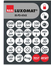
IR-PD-KNX Art.No: 92123

Dimensions: 47 x 19 x 10 mm Degree / class of protection: IP20 Ambient temperature: -20 °C to +40 °C