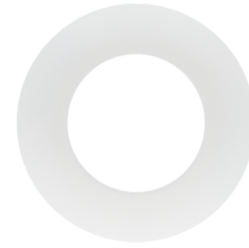
Cover ring PD9 Ø 36 mm Art.No: 92238

Dimensions: Ø 36 mm Housing: polycarbonate, UV-resistant Material color: anthracite glossy