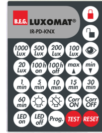
IR-PD-KNX Art.No: 92123

Dimensions: 47 x 19 x 10 mm Degree / class of protection: IP20 Ambient temperature: -20 °C to +40 °C