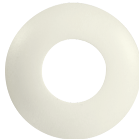
Cover ring PD9 Ø 45 mm Art.No: 92327

Dimensions: Ø 36 mm Housing: polycarbonate, UV-resistant Material color: silver glossy