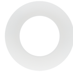
Cover ring PD9 Ø 36 mm Art.No: 92238

Dimensions: Ø 36 mm Housing: polycarbonate, UV-resistant Material color: anthracite glossy