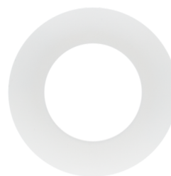
Cover ring PD9 Ø 36 mm Art.No: 92238

Voltage: 110 – 240 V AC 50 / 60 Hz Dimensions: Sensor head: Ø 45 x 37 mm, Power supply: 165 x 24 x 24 mm Power consumption: approx. 0.5 W