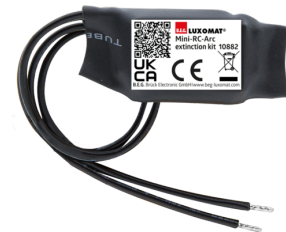
Mini-RC-Arc extinction kit Art.No: 10882

Battery: 3.0 V Lithium CR2032 (inclusive) Dimensions: 80 x 60 x 8 mm Material color: -