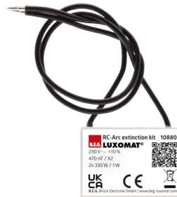
RC-Arc extinction kit Art.No: 10880

Dimensions: 47 x 19 x 10 mm Degree / class of protection: IP20 Ambient temperature: -20 °C to +40 °C