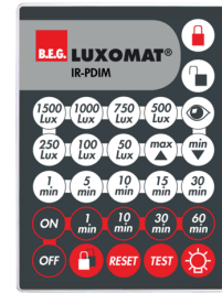
IR-PDIM Art.No: 92200

Voltage: 230 V AC ±10% Dimensions: 38 x 12 x 26 mm Degree / class of protection: IP20 / Class II