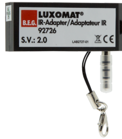
IR-Adapter for Smartphones Art.No: 92726

Battery: 3.0 V Lithium CR2032 (inclusive) Dimensions: 57 x 35 x 7 mm Material color: -