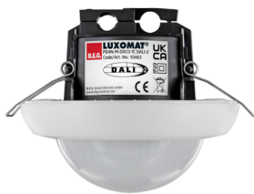
PD4N-M-DACO-1C DALI-2 Art.No: 93463

To receive the bundle according to the technical specification, please order the items listed.