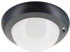
Corridor lens PD4N type A, Cover ring

Detection area: horizontal 360° (Ceiling mounting) Range: max. &Oslash; 40 m across<br>max. &Oslash; 20 m towards Monitored area (tangential movement): 250 m 2 / 2.5 m mounting height