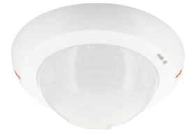
Corridor lens PD4N type A, Cover ring

Dimensions: 133 x 133 x 69 mm Degree / class of protection: IP65 Material color: white