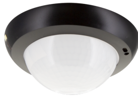
Corridor lens PD4N type A, Cover ring

Detection area: horizontal 360° (Ceiling mounting) Range: max. &Oslash; 40 m across<br>max. &Oslash; 20 m towards Monitored area (tangential movement): 250 m 2 / 2.5 m mounting height