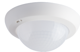
Corridor lens PD4N type A

Detection area: horizontal 360° (Ceiling mounting) Range: max. &Oslash; 40 m across<br>max. &Oslash; 20 m towards Monitored area (tangential movement): 250 m 2 / 2.5 m mounting height