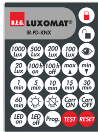
IR-PD-KNX Art.No: 92123

Dimensions: 40 x 55 x 103 mm Material color: black Frequency: 2.4 GHz ISM band, GFSK 0.2 dBm + 5.3 dBi = 5.5 dBm