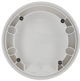
SM socle mounting set IP54 PD2N-FM Art.No: 93307

Dimensions: Ø 200 x 90 mm Impact strength: IK09 Housing: coated steel basket