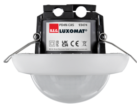
PD4N-CAS Art.No: 93474

To receive the bundle according to the technical specification, please order the items listed.