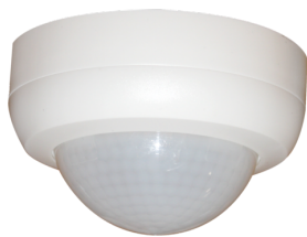
PD4N-1C-SM Art.No: 92144

To receive the bundle according to the technical specification, please order the items listed.