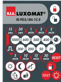
IR-PD3/4N-1C-E Art.No: 93110

Battery: 3.0 V Lithium CR2032 (inclusive) Dimensions: 80 x 60 x 8 mm Material color: -