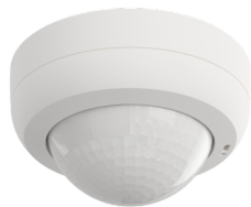
PD4N-1C-C-SM Art.No: 92270

To receive the bundle according to the technical specification, please order the items listed.