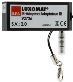
IR-Adapter for Smartphones Art.No: 92726

Dimensions: 40 x 55 x 103 mm Material color: black Frequency: 2.4 GHz ISM band, GFSK 0.2 dBm + 5.3 dBi = 5.5 dBm