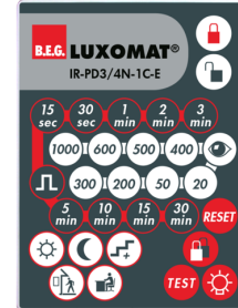
IR-PD3/4N-1C-E Art.No: 93110

Battery: 3.0 V Lithium CR2032 (inclusive) Dimensions: 80 x 60 x 8 mm Material color: -