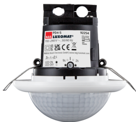
PD4-S-FC Art.No: 92254

To receive the bundle according to the technical specification, please order the items listed.