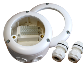
Surface mounting socket IP65 PD4-SM IP54 Art.No: 92376

Dimensions: Ø 200 x 90 mm Impact strength: IK09 Housing: coated steel basket