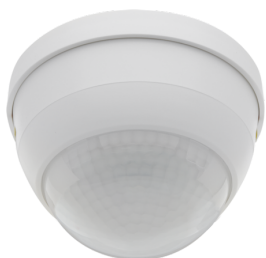
PD4-S-C-SM Art.No: 92442

To receive the bundle according to the technical specification, please order the items listed.