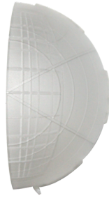
Blinds PD4 Art.No: 92313

Dimensions: Ø 200 x 90 mm Impact strength: IK09 Housing: coated steel basket