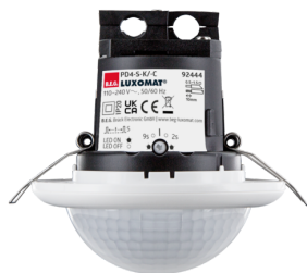
PD4-S-C-FC Art.No: 92444

To receive the bundle according to the technical specification, please order the items listed.