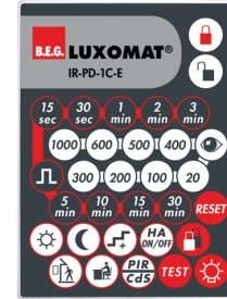
IR-PD-1C-E Art.No: 92077

Battery: 3.0 V Lithium CR2032 (inclusive) Dimensions: 80 x 60 x 8 mm Material color: -