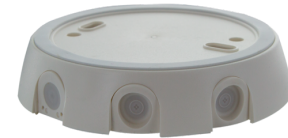
Socket IP54 PD4-TRIO-SM Art.No: 92386

Dimensions: Ø 200 x 90 mm Impact strength: IK09 Housing: coated steel basket