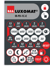
IR-PD-1C-E Art.No: 92077

Battery: 3.0 V Lithium CR2032 (inclusive) Dimensions: 80 x 60 x 8 mm Material color: -