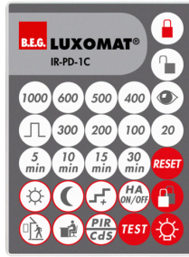
IR-PD-1C Art.No: 92520

Dimensions: 40 x 55 x 103 mm Material color: black Frequency: 2.4 GHz ISM band, GFSK 0.2 dBm + 5.3 dBi = 5.5 dBm