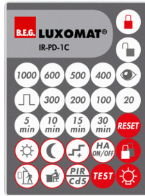
IR-PD-1C Art.No: 92520

Dimensions: 40 x 55 x 103 mm Material color: black Frequency: 2.4 GHz ISM band, GFSK 0.2 dBm + 5.3 dBi = 5.5 dBm