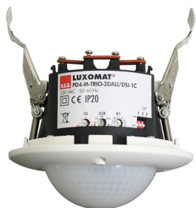
PD4-M-TRIO-2DALI/DSI-1C-FC Art.No: 92756

To receive the bundle according to the technical specification, please order the items listed.