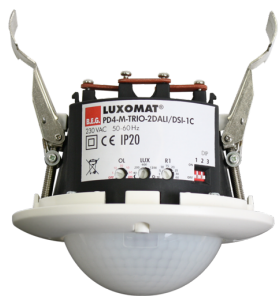
PD4-M-TRIO-2DALI/DSI-1C-FC Art.No: 92756

To receive the bundle according to the technical specification, please order the items listed.