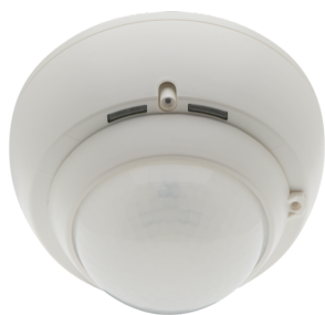
PD4-M-DAA4G-SM Art.No: 92743

To receive the bundle according to the technical specification, please order the items listed.