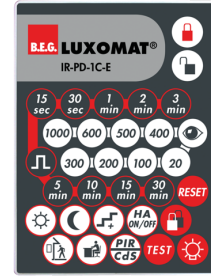
IR-PD-1C-E Art.No: 92077

Battery: 3.0 V Lithium CR2032 (inclusive) Dimensions: 57 x 35 x 7 mm Material color: -