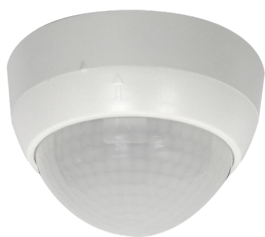
PD4-M-1C-GH-SM Art.No: 92245

To receive the bundle according to the technical specification, please order the items listed.