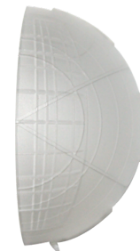
Blinds PD4 Art.No: 92313

Dimensions: \varnothing 200 x 90 mm Impact strength: IK09 Housing: coated steel basket