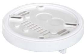
SM socket IP54 for PD2- / PD4-SM Art.No: 92161

Dimensions: \varnothing 115 x 70 mm Degree / class of protection: IP65 Impact strength: IK07