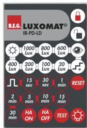
IR-PD-LD Art.No: 92479

Dimensions: 40 x 55 x 103 mm Material color: black Frequency: 2.4 GHz ISM band, GFSK 0.2 dBm + 5.3 dBi = 5.5 dBm