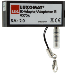
IR-Adapter for Smartphones Art.No: 92726

Battery: 3 x 1.5 V Micro AAA (not included) Dimensions: 83 x 53 x 17 mm Material color: -