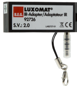
IR-Adapter for Smartphones Art.No: 92726

Battery: 3 x 1.5 V Micro AAA (not included) Dimensions: 83 x 53 x 17 mm Material color: -