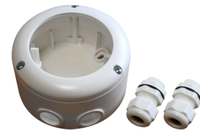
Surface mounting socket IP65 for PD4-SM IP20 Art.No: 92375

Dimensions: 47 x 19 x 10 mm Degree / class of protection: IP20 Ambient temperature: -20 °C to +40 °C