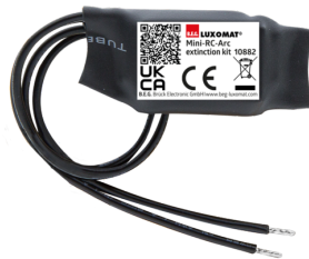
Mini-RC-Arc extinction kit Art.No: 10882

Voltage: 230 V AC \pm 10\% Dimensions: 38 x 12 x 26 mm Degree / class of protection: IP20 / Class II