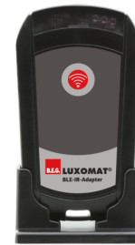
BLE-IR-Adapter Art.No: 93067

Voltage: 230 V AC \pm 10\% Dimensions: 50 x 23 x 8 mm Degree / class of protection: IP20 / Class II