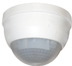
PD4-M-1C-C-SM Art.No: 92587

To receive the bundle according to the technical specification, please order the items listed.