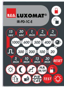
IR-PD-1C-E Art.No: 92077

Battery: 3.0 V Lithium CR2032 (inclusive) Dimensions: 80 x 60 x 8 mm Material color: -