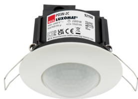
PD3N-2C-FC Art.No: 92198

To receive the bundle according to the technical specification, please order the items listed.