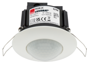
PD3N-2C-FC Art.No: 92198

To receive the bundle according to the technical specification, please order the items listed.