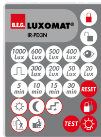
IR-PD3N Art.No: 92105

Battery: 3.0 V Lithium CR2032 (inclusive) Dimensions: 80 x 60 x 8 mm Material color: -