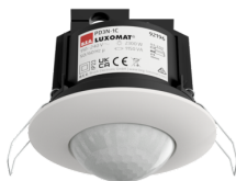
PD3N-1C-FC Art.No: 92196

To receive the bundle according to the technical specification, please order the items listed.