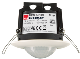
PD3N-1C-FC Micro Art.No: 92184

To receive the bundle according to the technical specification, please order the items listed.