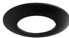
Cover ring PD3N FC Art.No: 93086

Dimensions: 83 x 83 x 8 mm Housing: polycarbonate, UV-resistant Material color: white mat, similar to RAL9010