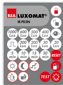
IR-PD3N Art.No: 92105

Battery: 3.0 V Lithium CR2032 (inclusive) Dimensions: 80 x 60 x 8 mm Material color: -