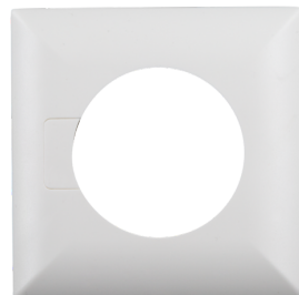
Square design frame PD3N-FC Art.No: 92991

Dimensions: Ø 200 x 90 mm Impact strength: IK09 Housing: coated steel basket