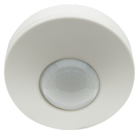
PD3-1C-SM Art.No: 92194

To receive the bundle according to the technical specification, please order the items listed.