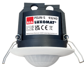
PD2N-S Art.No: 93240

To receive the bundle according to the technical specification, please order the items listed.