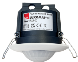
PD2N-RF-KNXs-DX-FC Art.No: 93580

To receive the bundle according to the technical specification, please order the items listed.